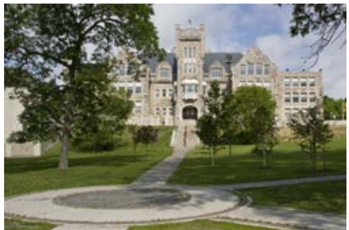
Bora Laskin Faculty of Law

Academy of Learning Career College (AOLCC) is a privately owned college located in Thunder Bay that offers over 25+ diploma and certificate programs, as well as individual courses. Visit AOLCC for more information at www.academyoflearning.com